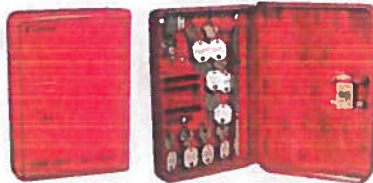
1400 Series KNOX® Elevator Box