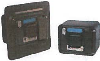
3200 Series KNOX-BOX®