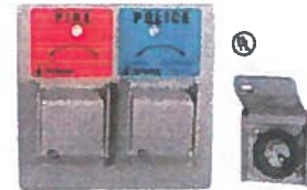
KNOX® Key Switches