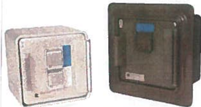
4400 Series KNOX-VAULT®