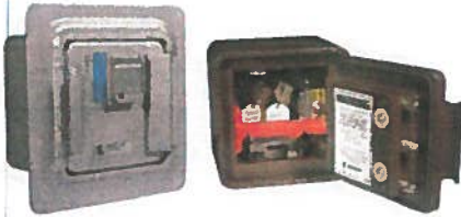
4100 Series KNOX-VAULT®